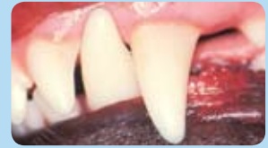
(a) Healthy mouth

Unfortunately once a tooth becomes loose, the problem has usually progressed too far to save that tooth. However if gum problems are identified at an earlier stage, a combination of a Scale and Polish and ongoing Home Care can make a real difference to your pet's oral health (and also their breath!). Please contact us today for further details!