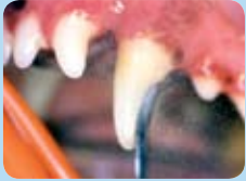
Removing the calculus using an ultrasonic scaler, followed by polishing the teeth is a very effective form of treatment

A healthy mouth typically has bright white teeth and shrimp pink (or sometimes pigmented) gums. However plaque bacteria are constantly accumulating on the surface of their teeth and will, in time, lead to inflammation of the gums – a condition called gingivitis . Affected gums are more reddened in appearance, and these changes may also be associated with localised mineralisation of the plaque to form calculus (tartar) – see picture (b).